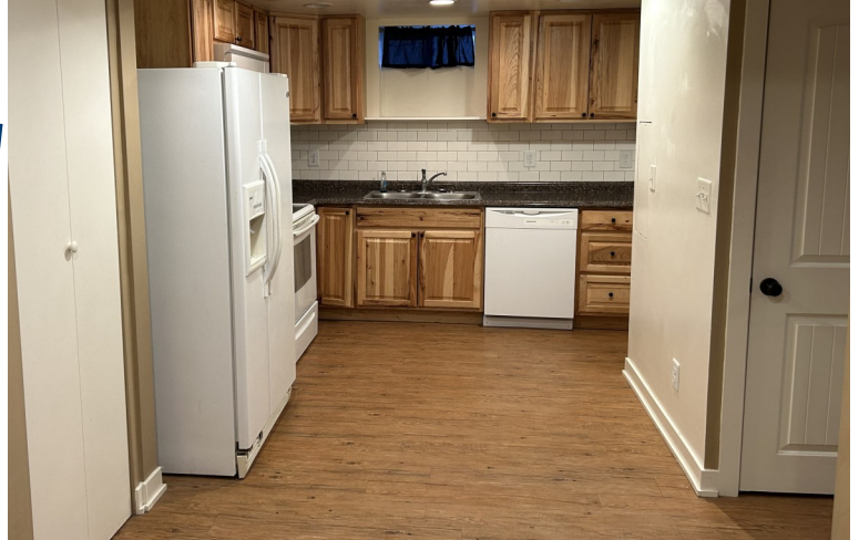
LOWER LEVEL APARTMENT KITCHEN