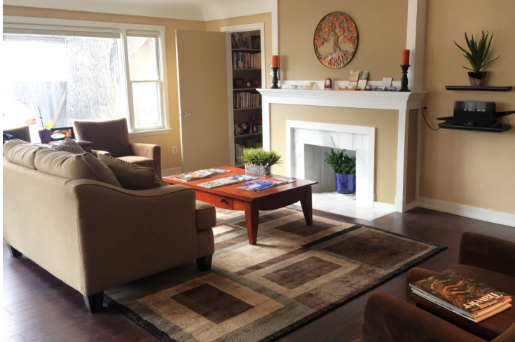
RECEPTION / WAITING ROOM