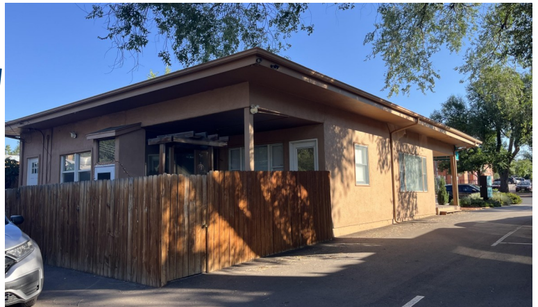
SIDE / BACK