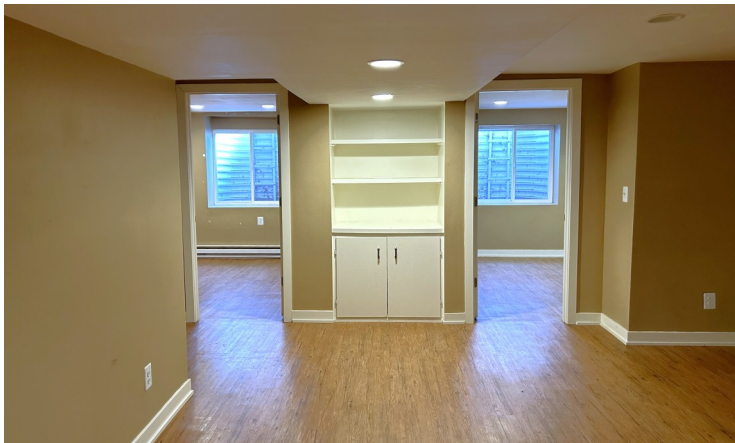
LOWER LEVEL APARTMENT