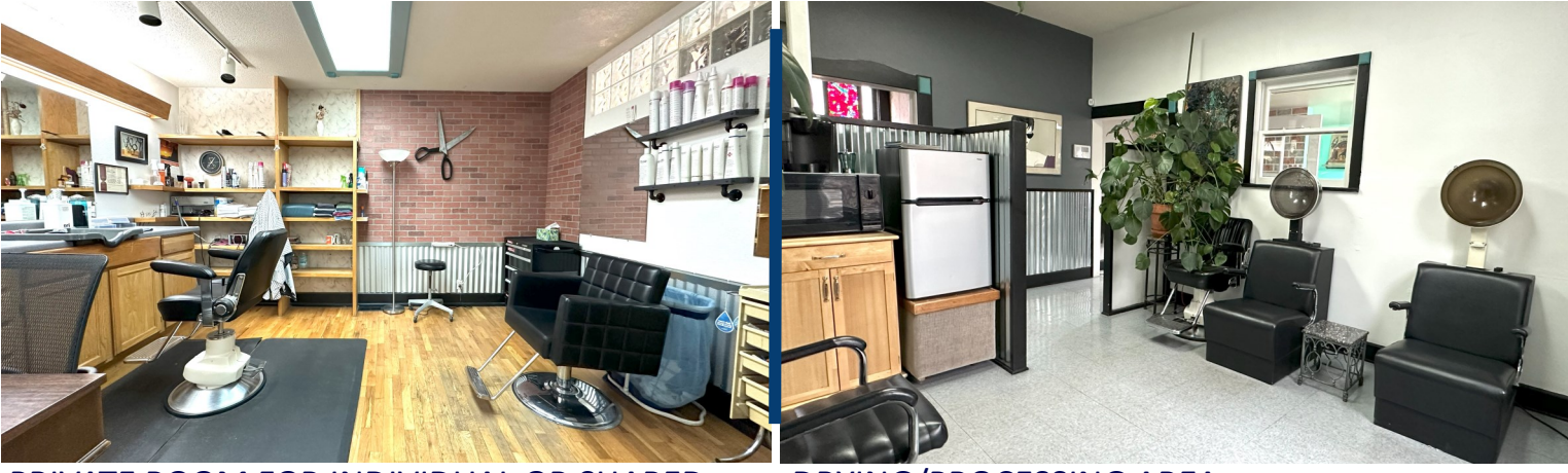
PRIVATE ROOM FOR INDIVIDUAL OR SHARED